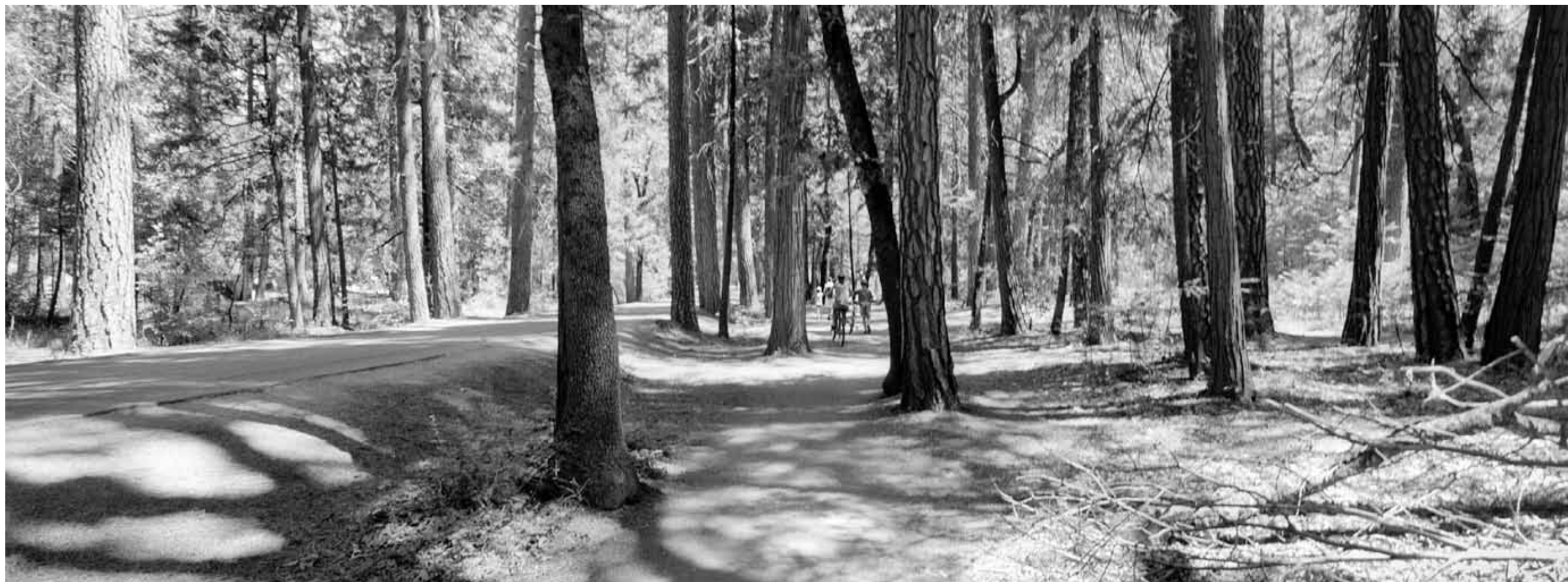
Journey Yosemite, 2011