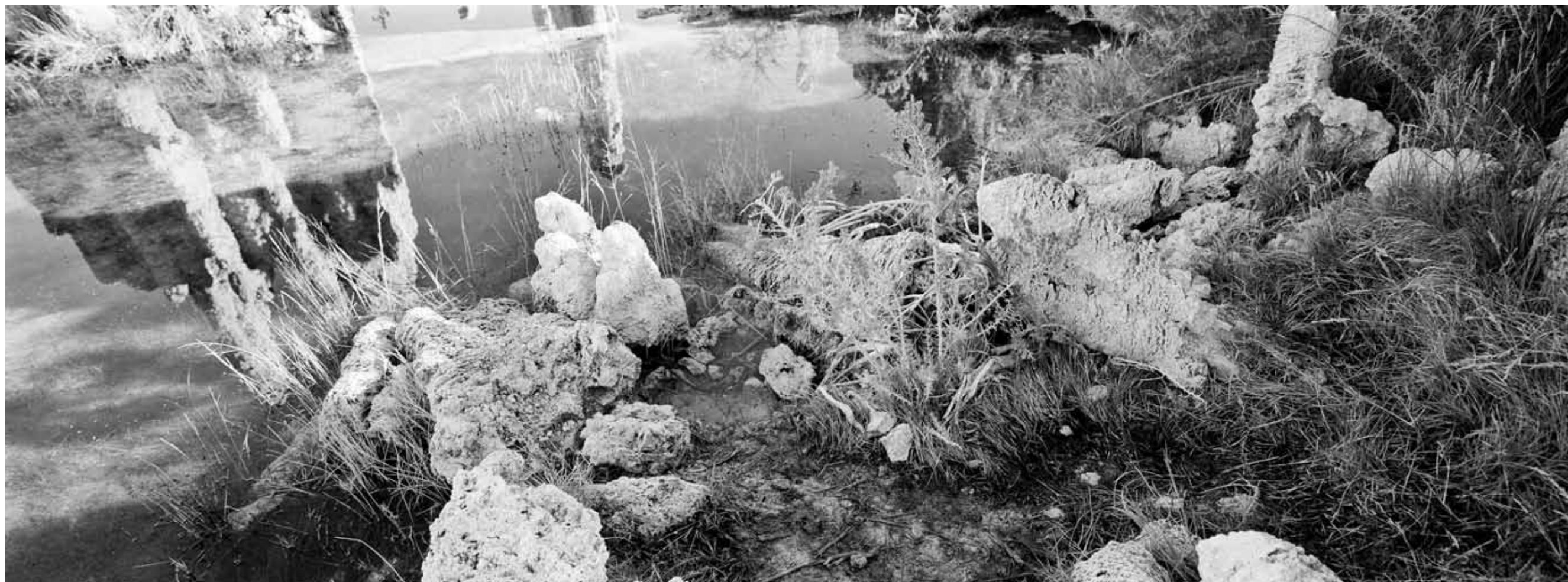
Tufa Reflection Mono Lake, 2011