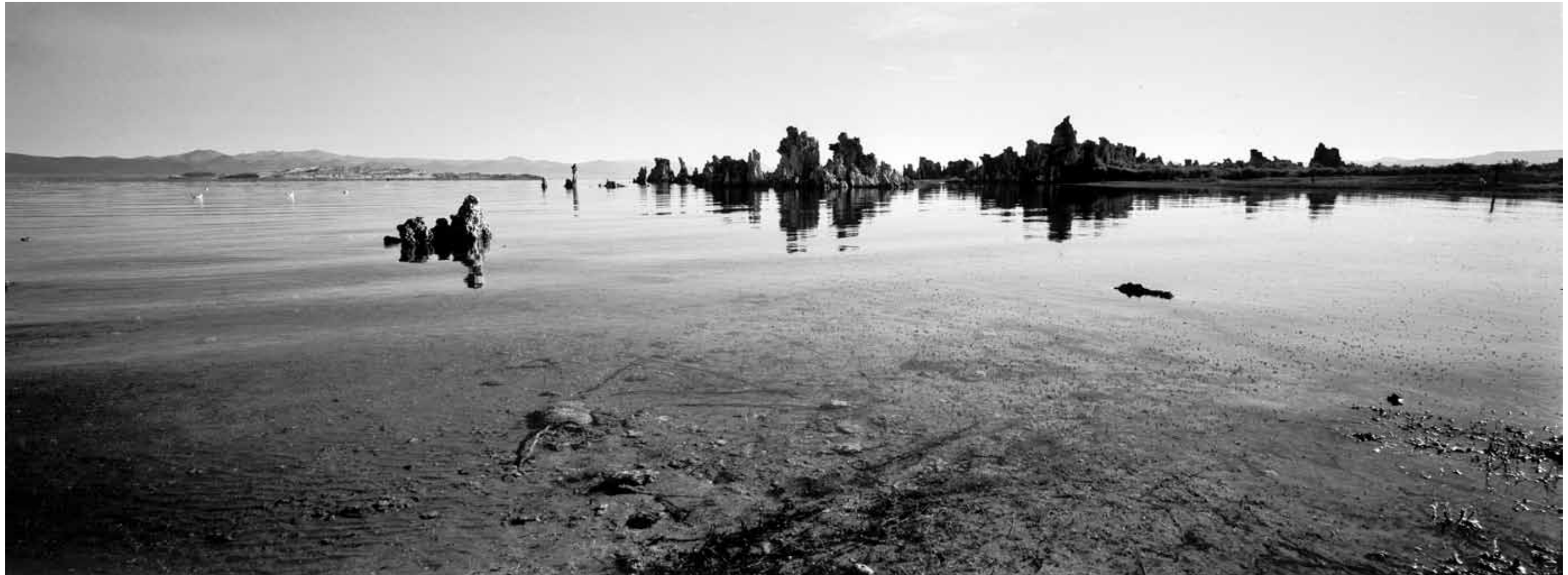
The Fractal Geometry of Tufa Mono Lake, 2011