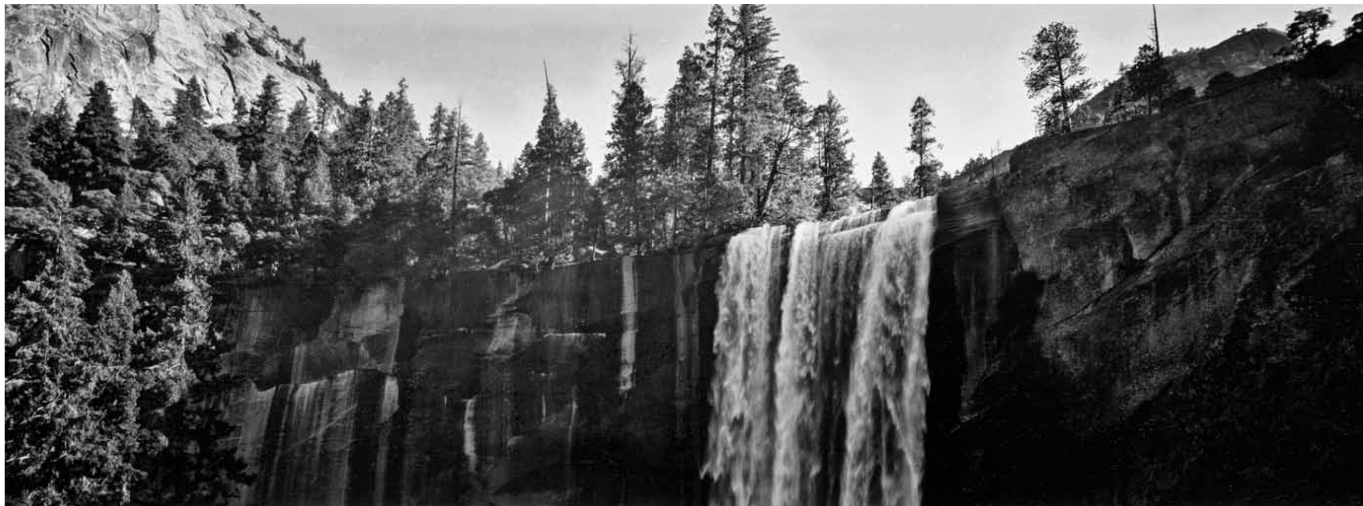
Vernal Fall Yosemite, 2011