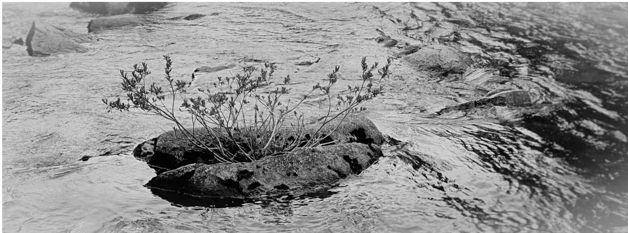
Islet Tuolumne River, Yosemite 2011