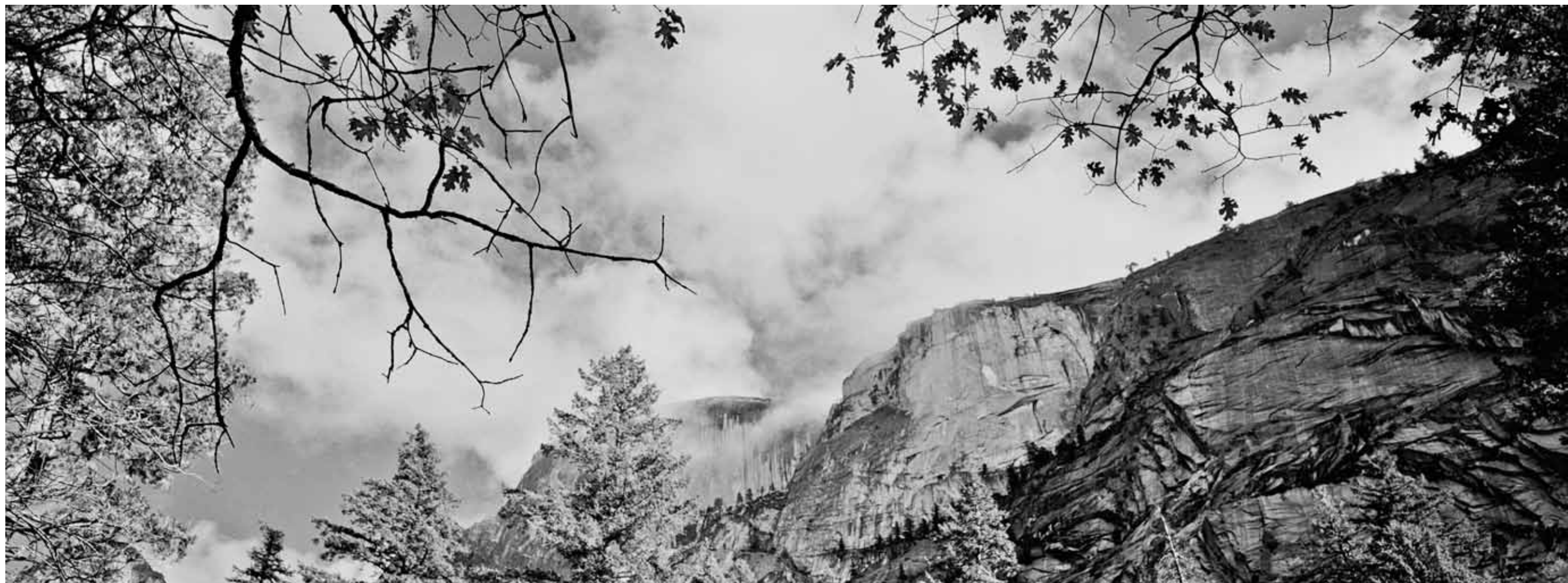
Harbinger of Rain Yosemite, 2011