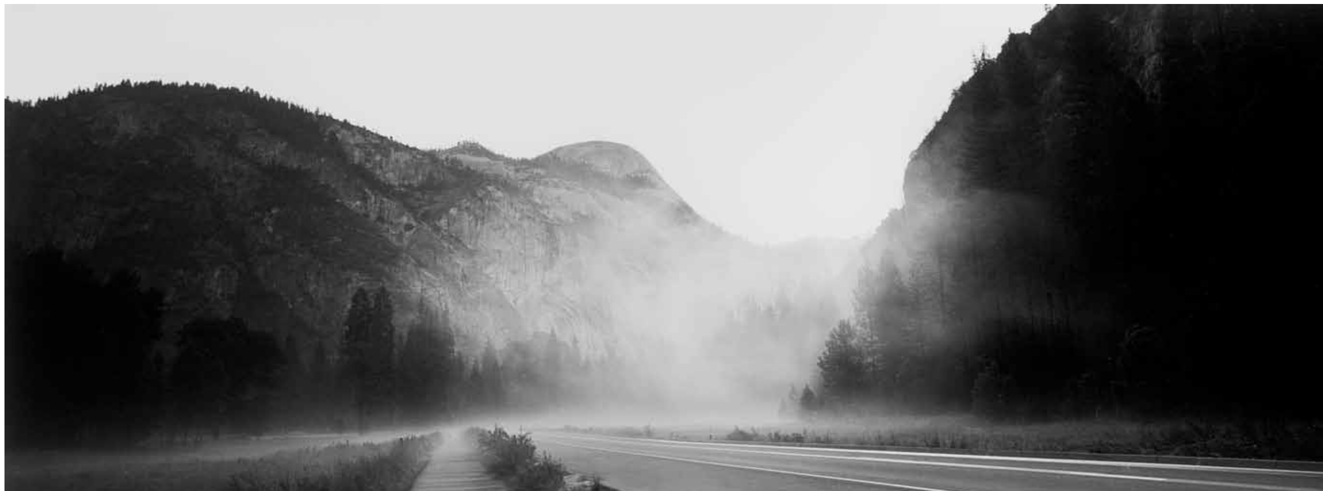
Morning Fog Yosemite, 2011