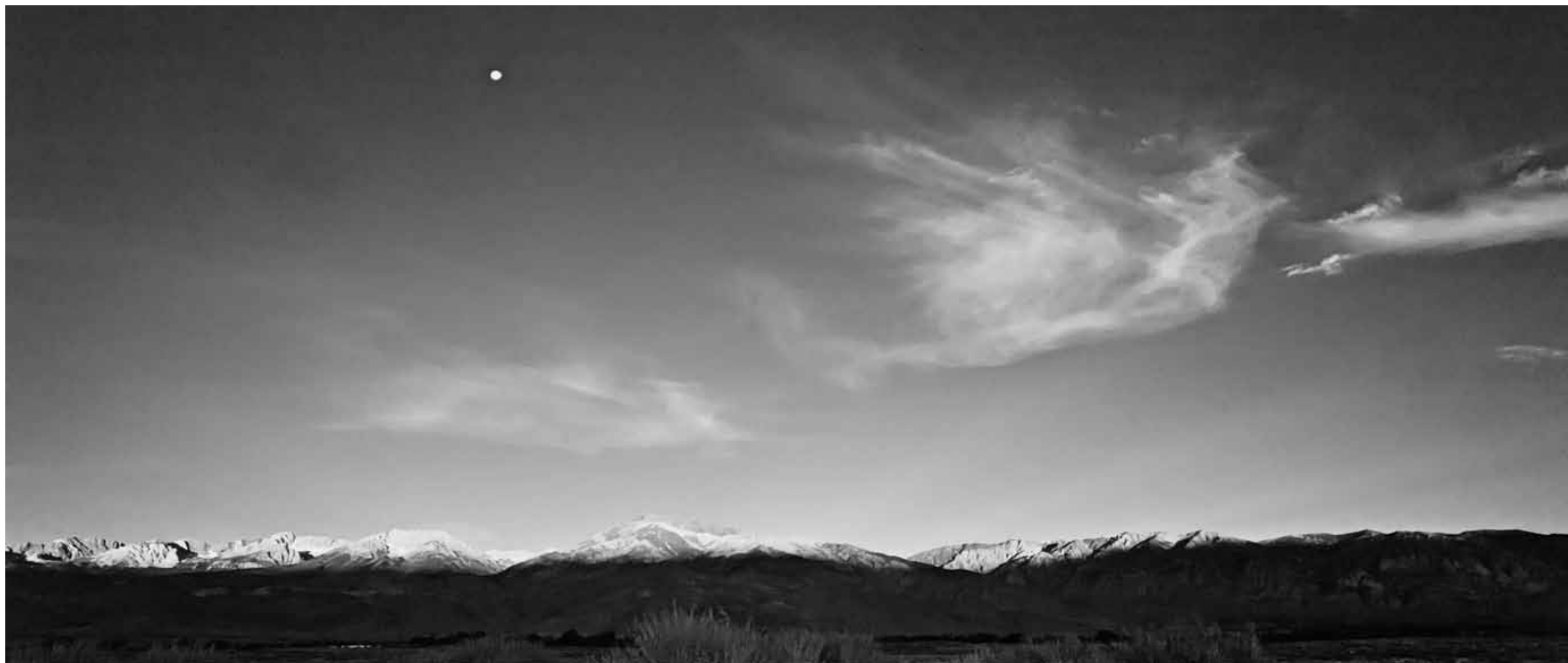
Full Moon Sunrise Ranges of Light, 2011