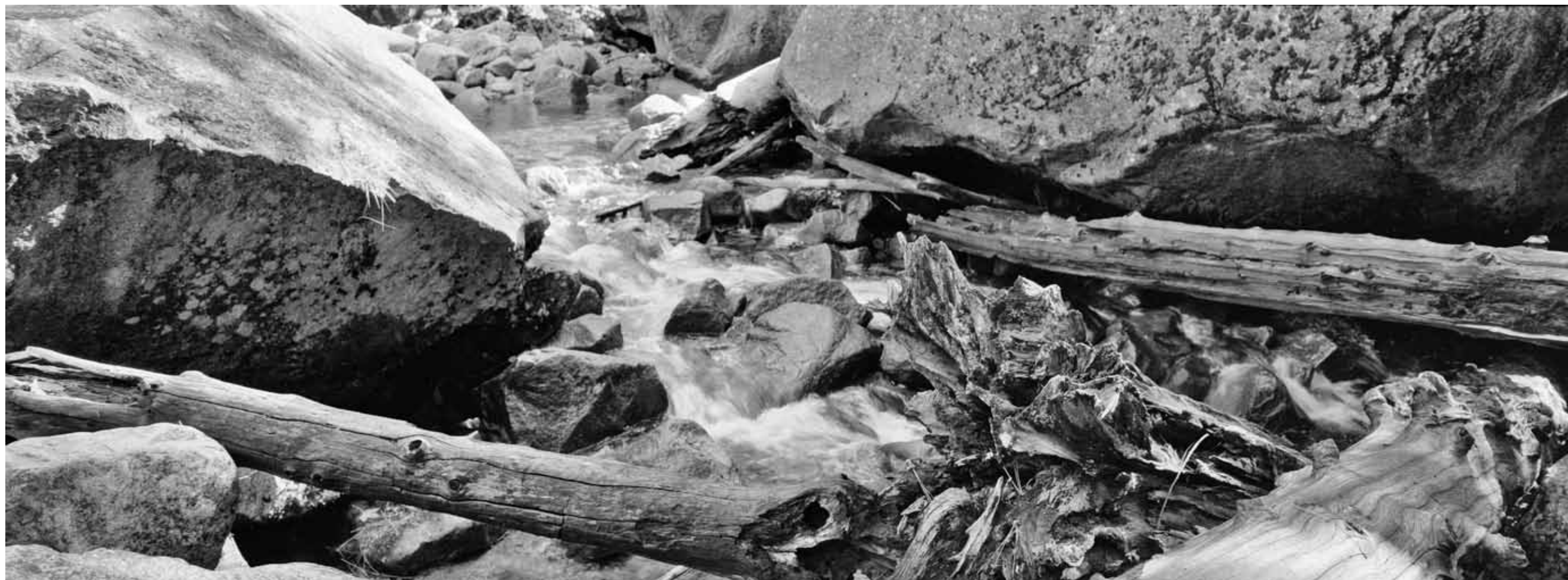
Logs Yosemite, 2011