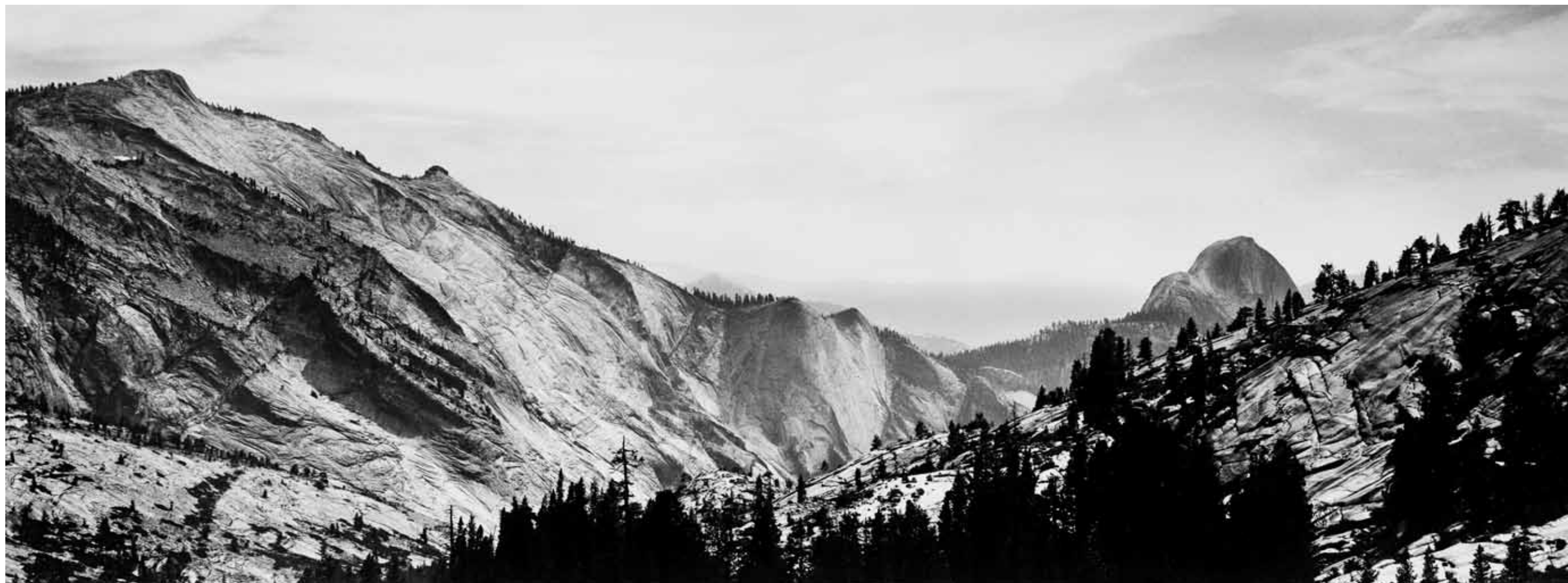
Half Dome Yosemite, 2011