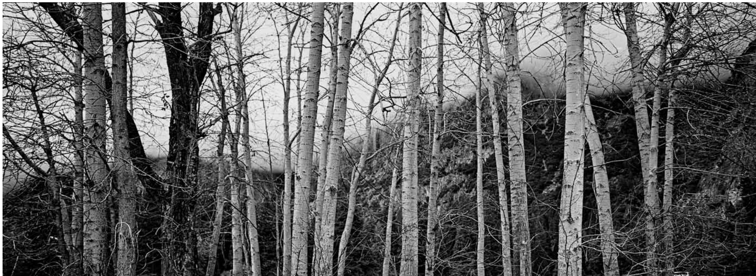
Trees Yosemite, 2011