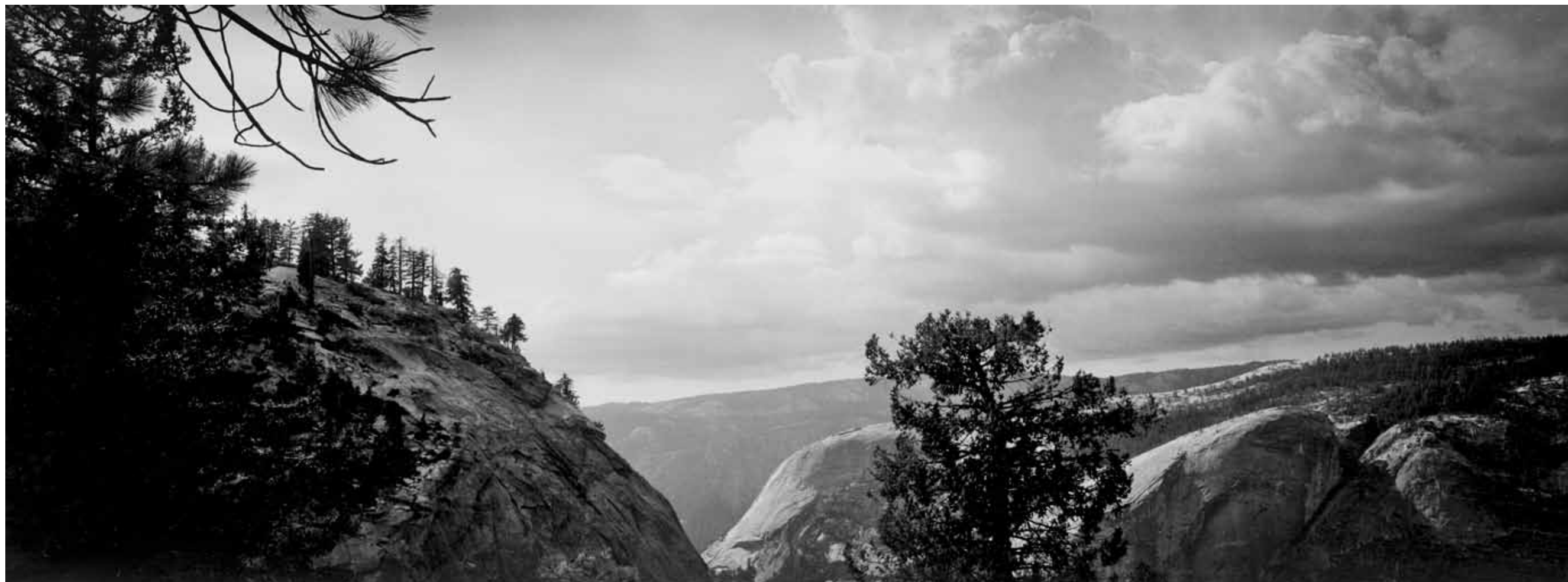
Meditation in Rocks Yosemite, 2011